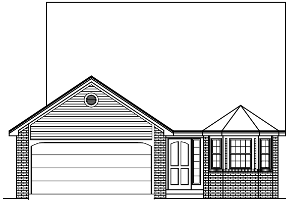
FRONT ELEVATION - B - 0101