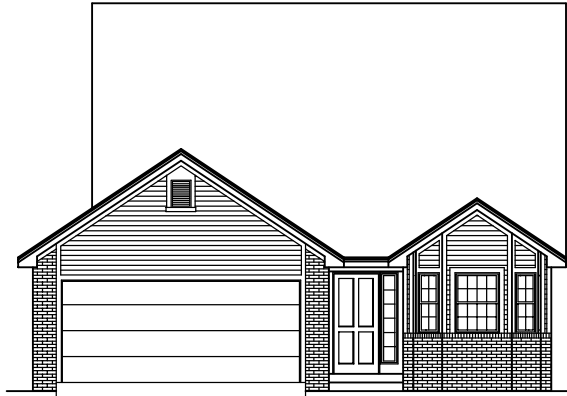
FRONT ELEVATION - A - 0101