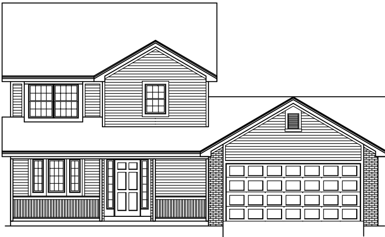
FRONT ELEVATION - B - 0102