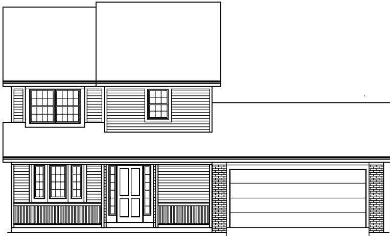
FRONT ELEVATION - A - 0102