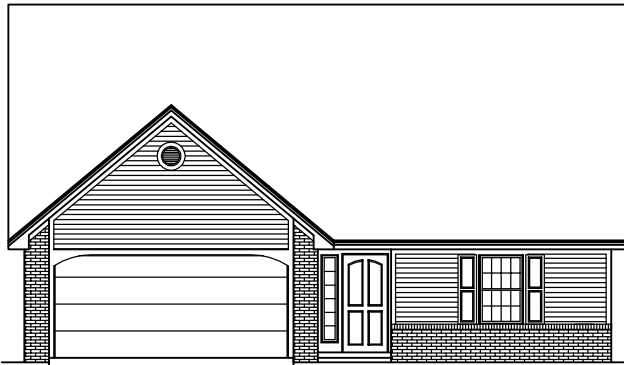
FRONT ELEVATION - A - 0103