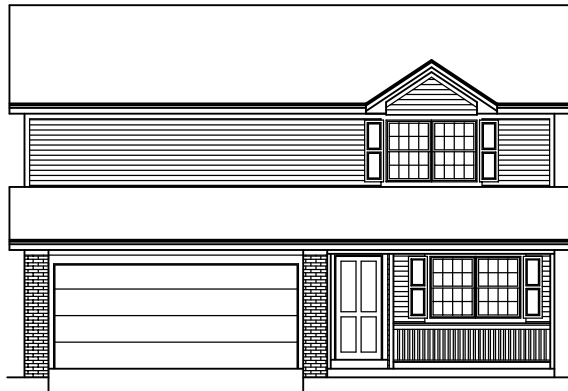
FRONT ELEVATION - B - 0104