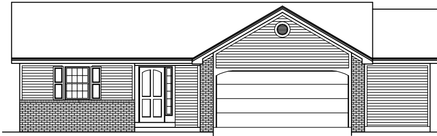
FRONT ELEVATION - A - 0106