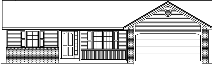
FRONT ELEVATION - A - 0108