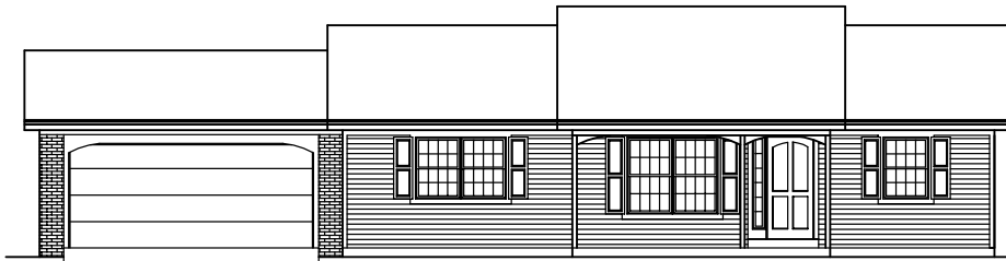
FRONT ELEVATION - A - 0109