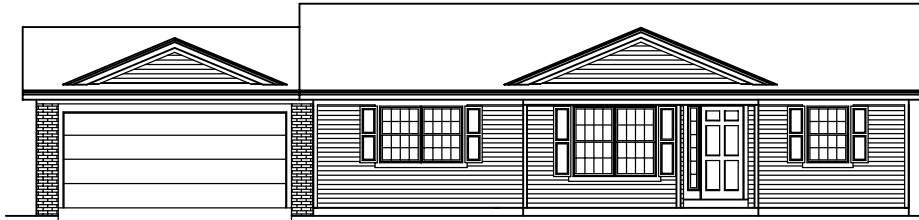
FRONT ELEVATION - B - 0109