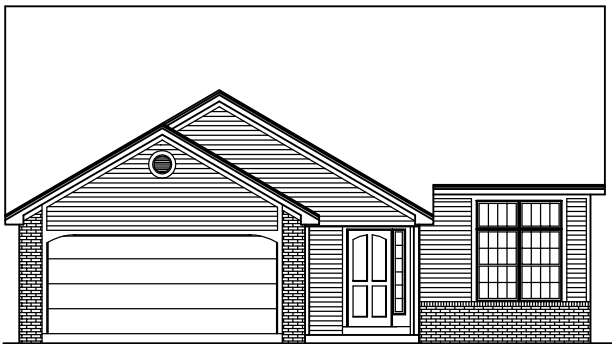
FRONT ELEVATION - A - 0110