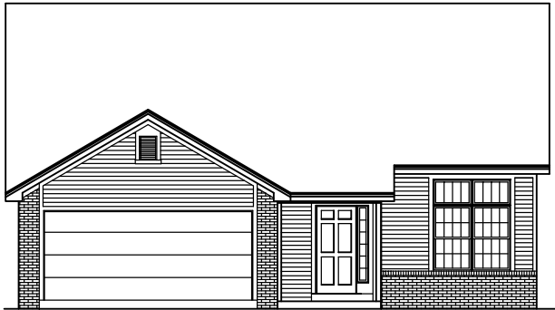
FRONT ELEVATION - B - 0110