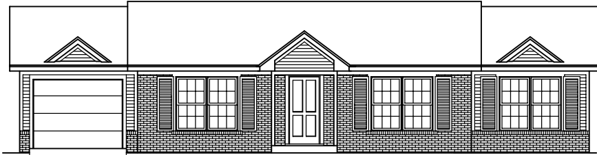
FRONT ELEVATION - A - 0111