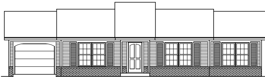
FRONT ELEVATION - C - 0111