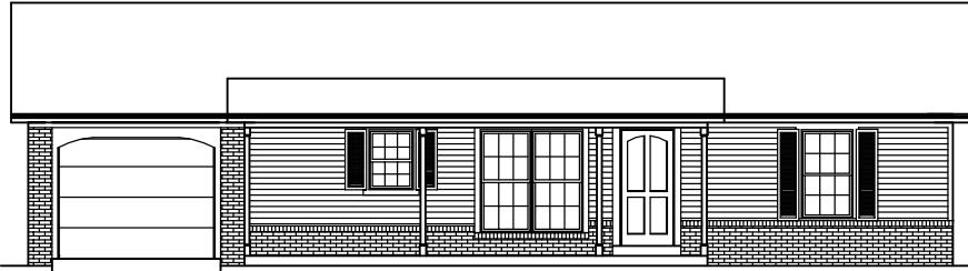
FRONT ELEVATION - A - 0112