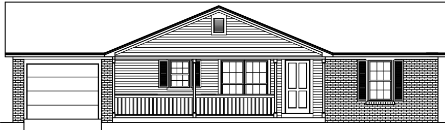
FRONT ELEVATION - B - 0112