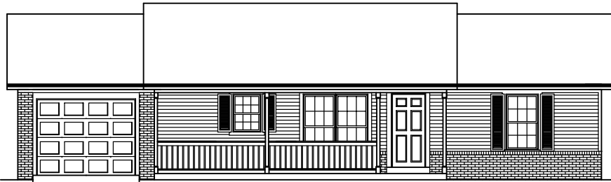
FRONT ELEVATION - C - 0112