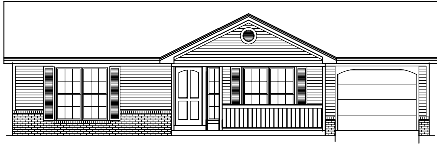
FRONT ELEVATION - A - 0113