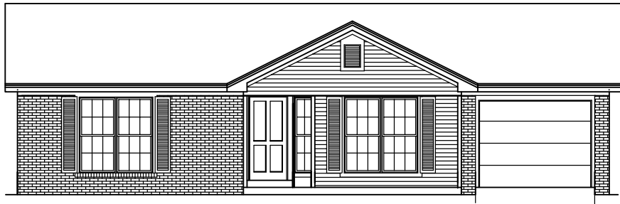
FRONT ELEVATION - B - 0113