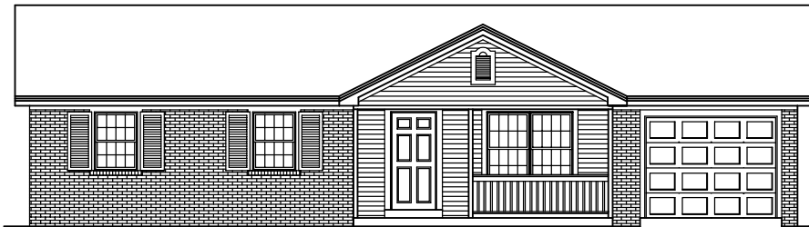
FRONT ELEVATION - C - 0114