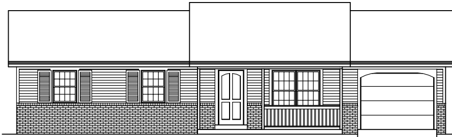
FRONT ELEVATION - A - 0114