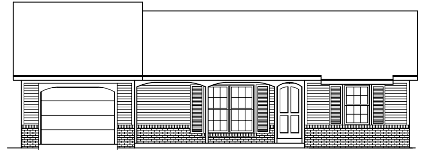
FRONT ELEVATION - A - 0115