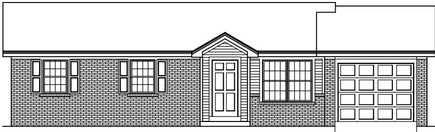
FRONT ELEVATION - C - 0116