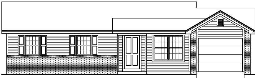
FRONT ELEVATION - B - 0116