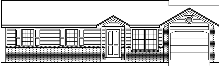
FRONT ELEVATION - A - 0116