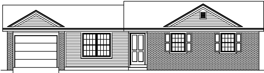
FRONT ELEVATION - B - 0117