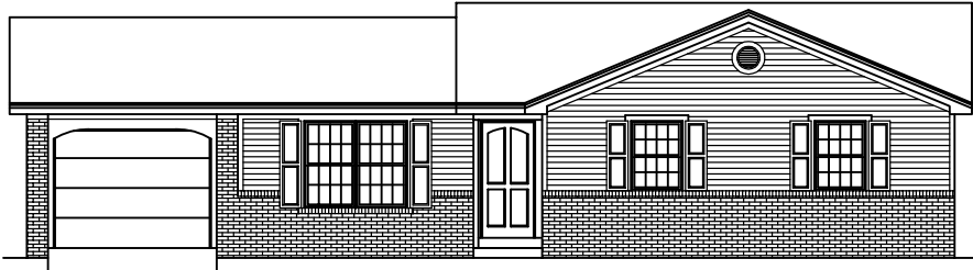
FRONT ELEVATION - A - 0117