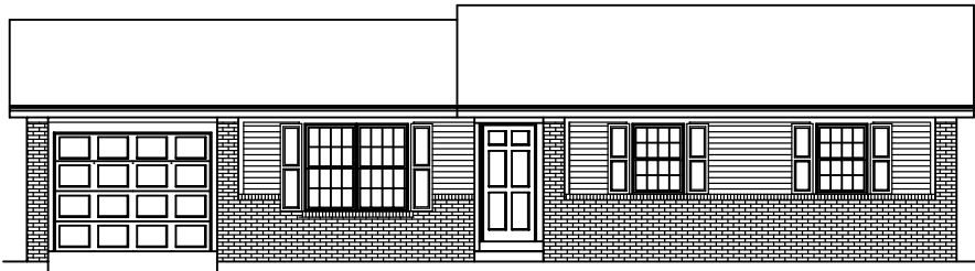
FRONT ELEVATION - C - 0117