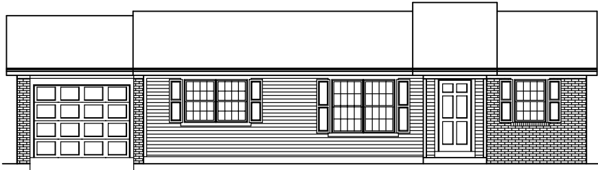
FRONT ELEVATION - C - 0118