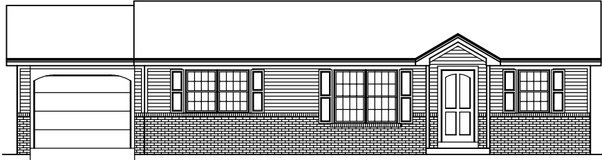
FRONT ELEVATION - A - 0118