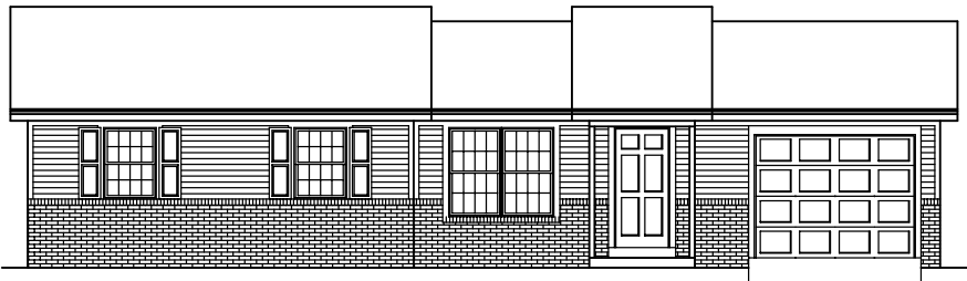
FRONT ELEVATION - C - 0119