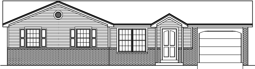
FRONT ELEVATION - A - 0119