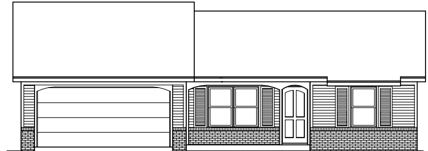
FRONT ELEVATION - A - 0120