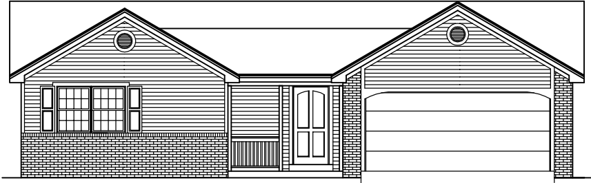
FRONT ELEVATION - A - 0121