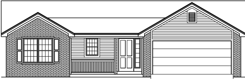
FRONT ELEVATION - A - 0122