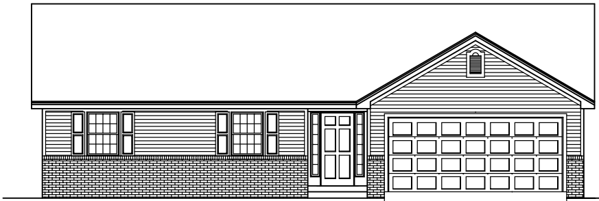
FRONT ELEVATION - C - 0125