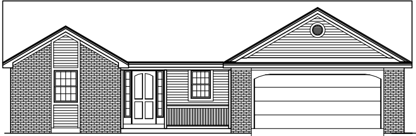
FRONT ELEVATION - A - 0126