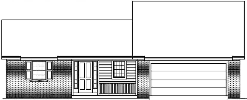
FRONT ELEVATION - B - 0126