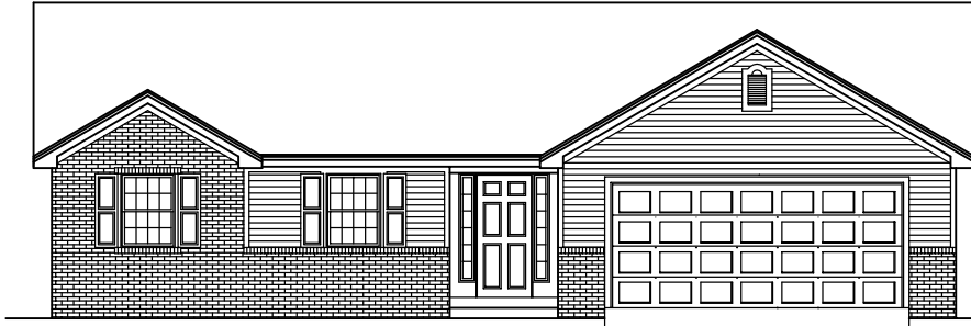
FRONT ELEVATION - A - 0127