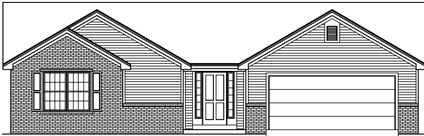
FRONT ELEVATION - B - 0128