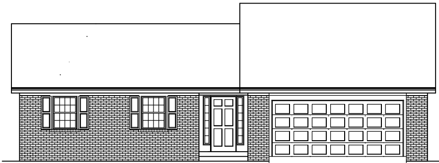
FRONT ELEVATION - C - 0129