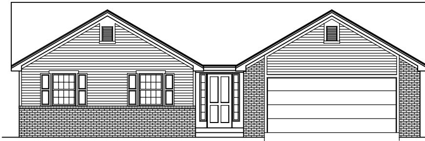
FRONT ELEVATION - A - 0129