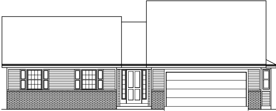
FRONT ELEVATION - C - 0130