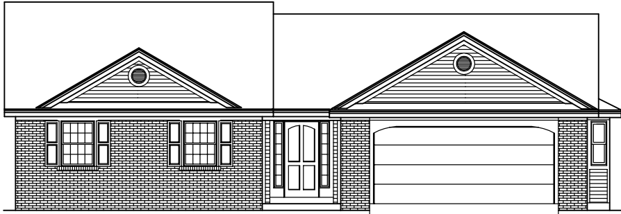
FRONT ELEVATION - B - 0130