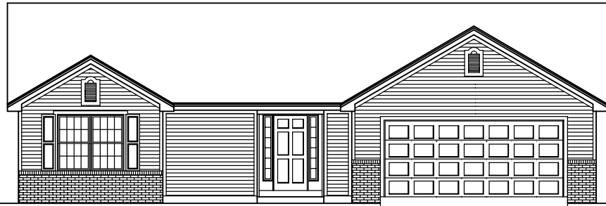
FRONT ELEVATION - A - 0131