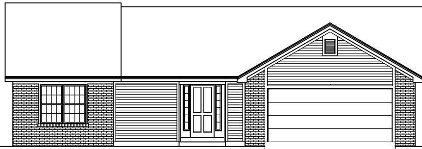
FRONT ELEVATION - B - 0131