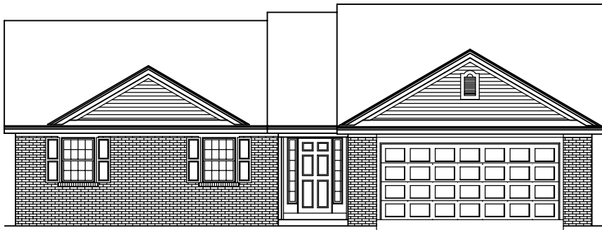
FRONT ELEVATION - C - 0132