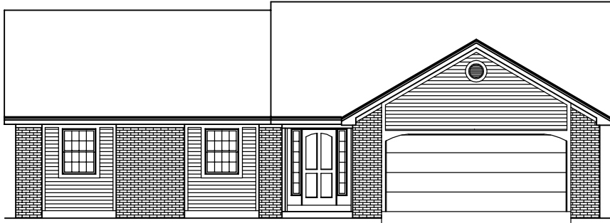
FRONT ELEVATION - A - 0132