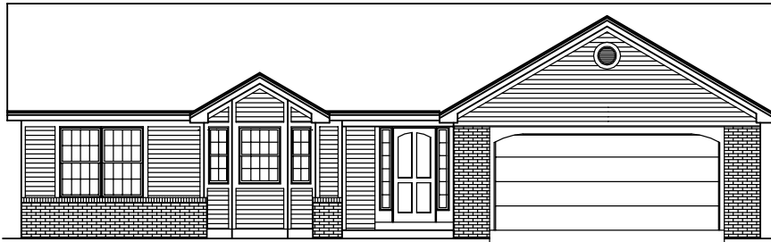
FRONT ELEVATION - A - 0133