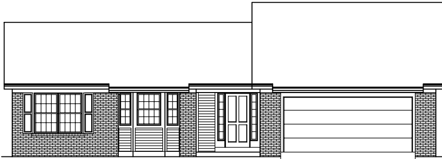
FRONT ELEVATION - B - 0133