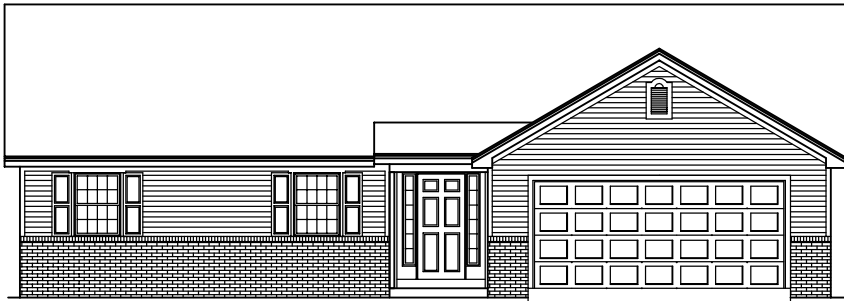
FRONT ELEVATION - C - 0134