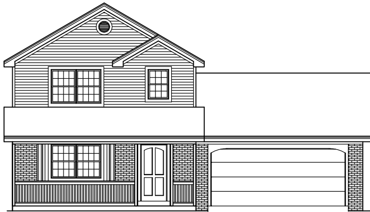
FRONT ELEVATION - A - 0201