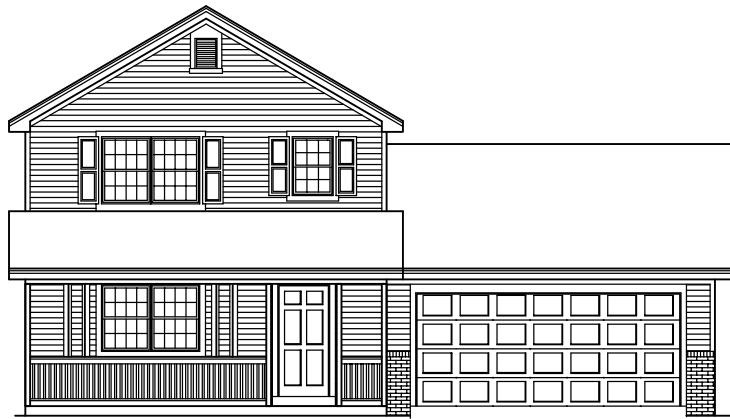
FRONT ELEVATION - B - 0201